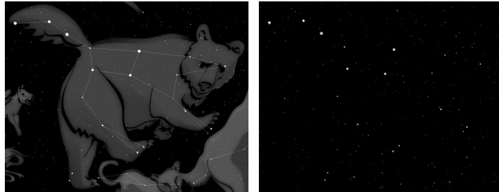
Figure 2: The constellation of Ursa Major.